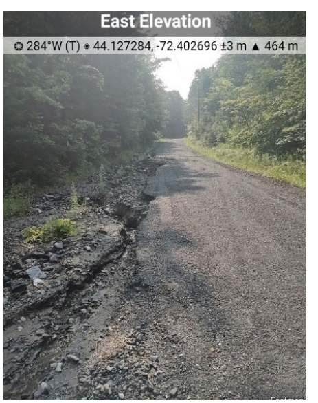
Reservoir Rd Cyr Road.