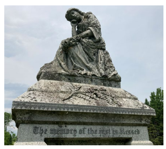
George St. Cemetery

The year 2023 was a wet one for the town of Orange's Cemetery Commission. We were able to perform a few burials before the epic July 10 flood event that left much of the lower Brookhaven cemetery grounds flooded. Burials were also conducted at the George Street Cemetery (also known as Orange Center Cemetery.)